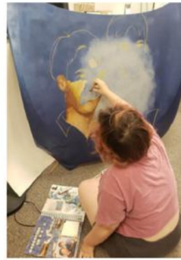
This portrait is of my dad (left) and my uncle (right) on a wrecked car hood. All together it represents the brotherhood that was wrecked due to the crash.