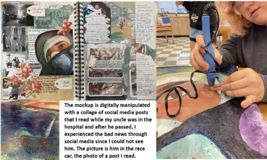
The mockup is digitally manipulated with a collage of social media posts that I read while my uncle was in the hospital and after he passed, I experienced the bad news through social media since I could not see him. The picture is him in the race car, the photo of a post I read.